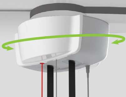
Motorized 360 degree rotation