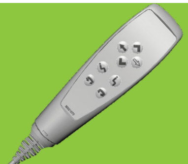
8-button convenient handset